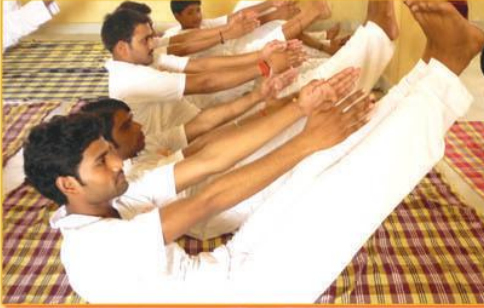
Yogasana & Pranayam