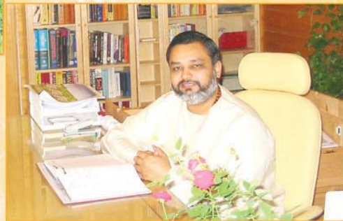
Study of Vedic Science